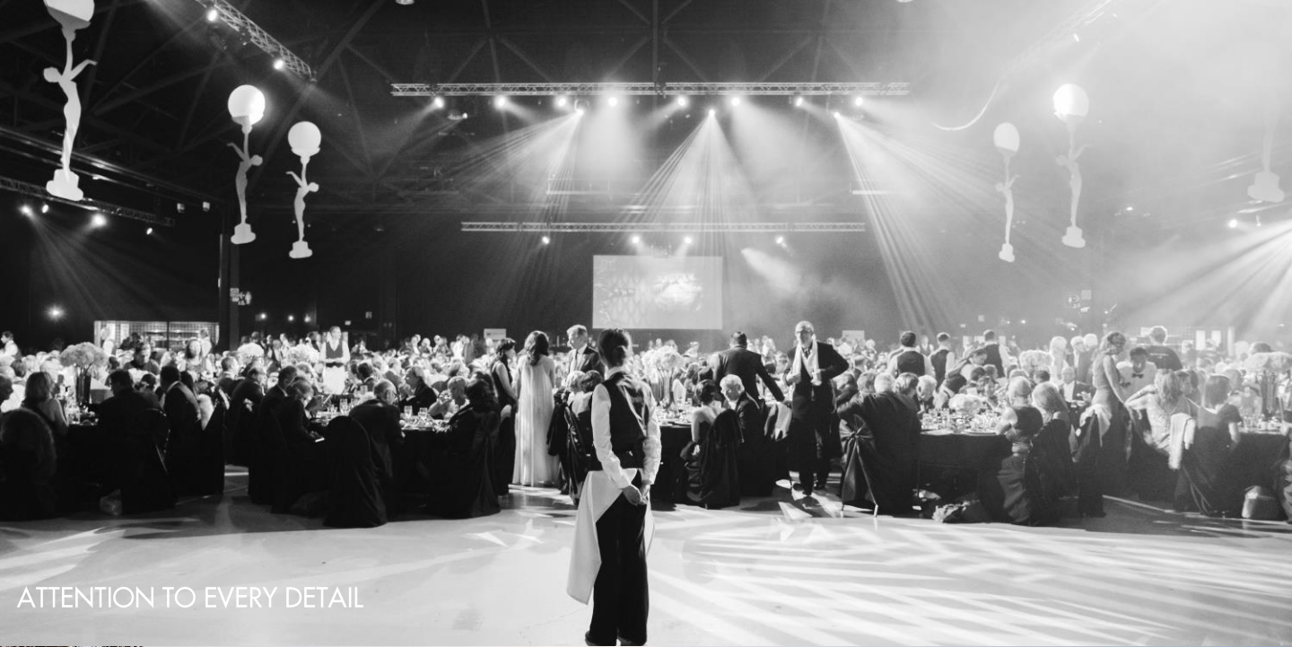
ATTENTION TO EVERY DETAIL