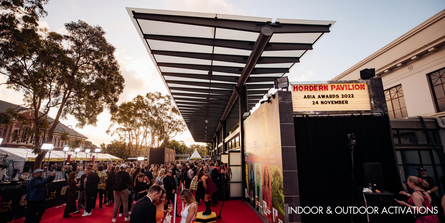
INDOOR & OUTDOOR ACTIVATIONS