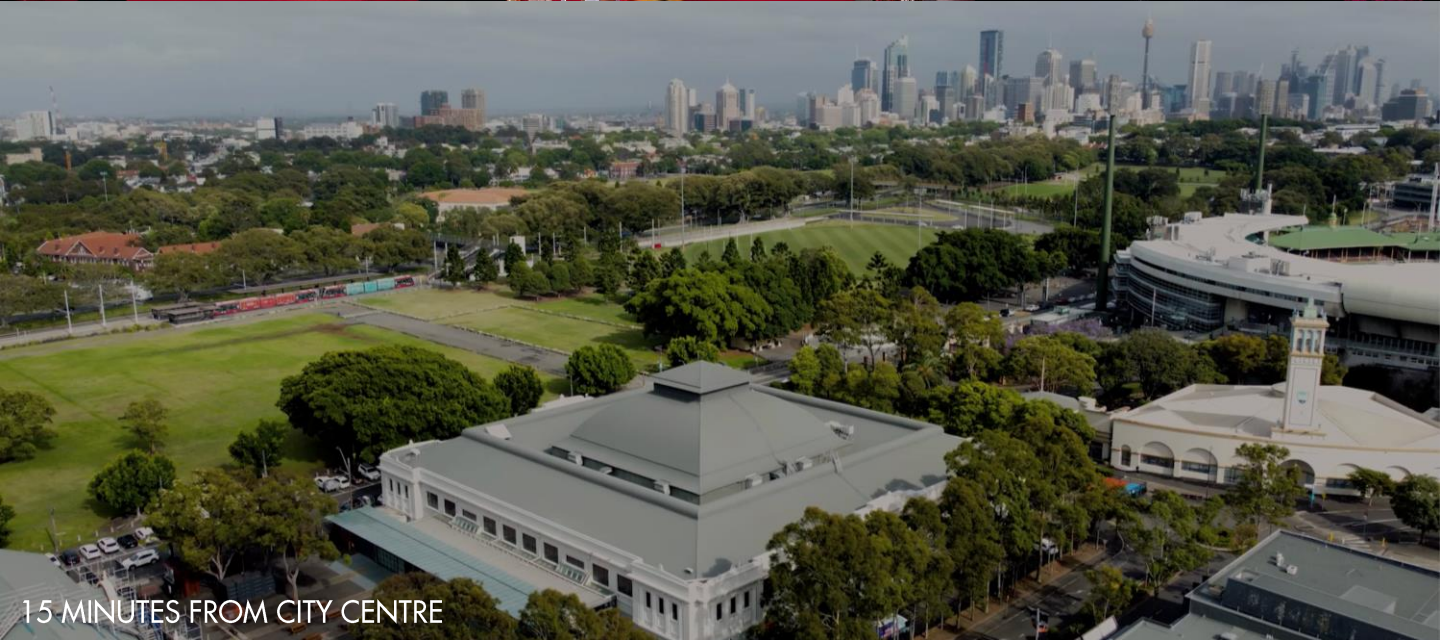
15 MINUTES FROM CITY CENTRE