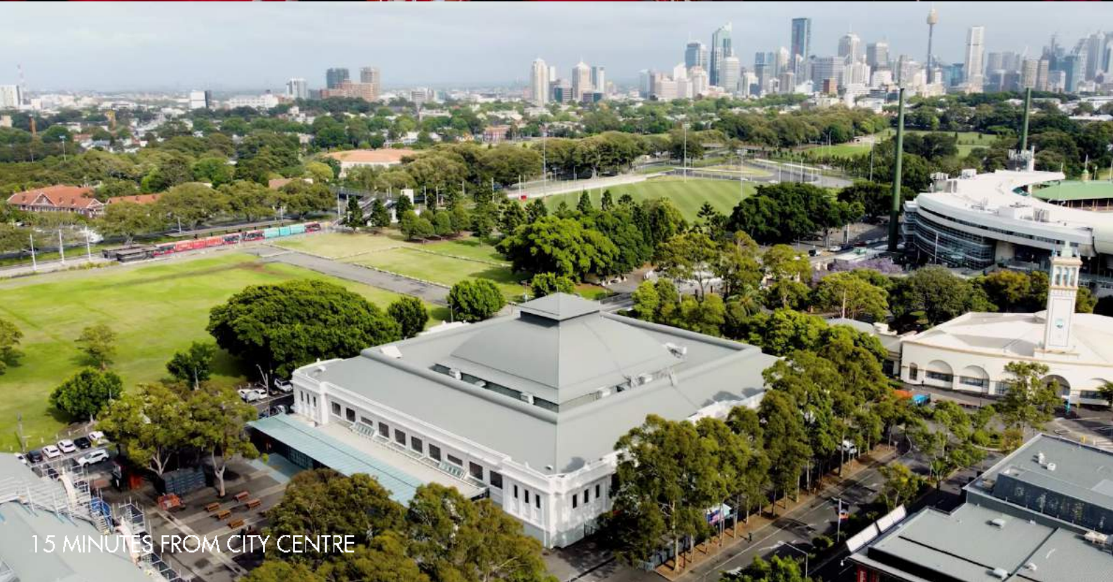
15 MINUTES FROM CITY CENTRE