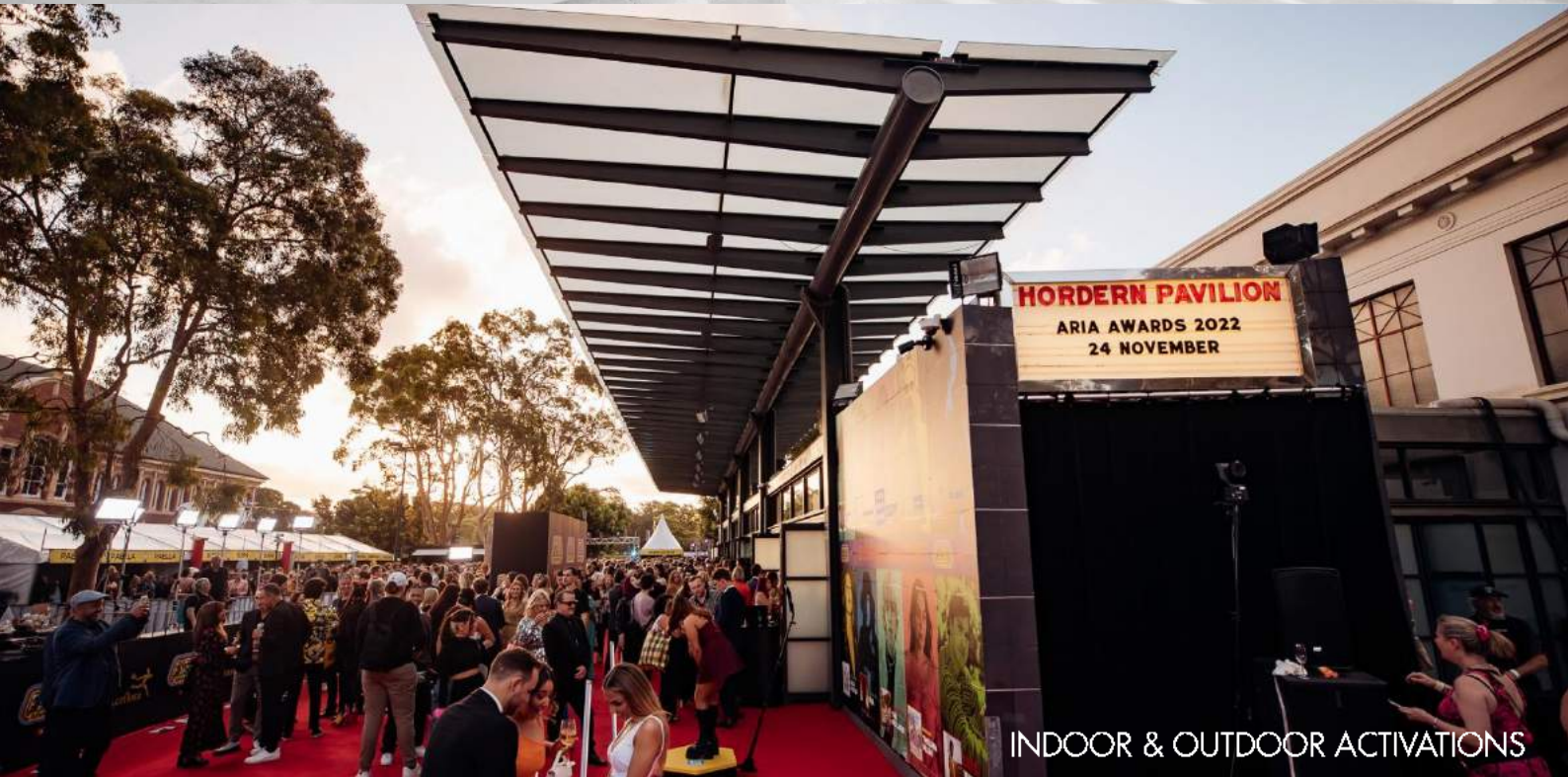
INDOOR & OUTDOOR ACTIVATIONS