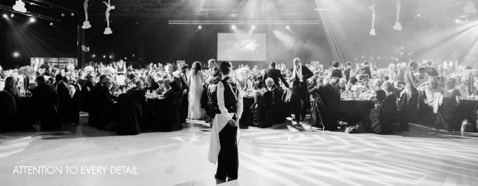
ATTENTION TO EVERY DETAIL