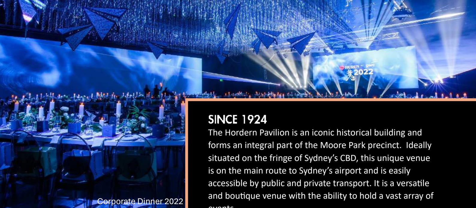
Corporate Dinner 2022